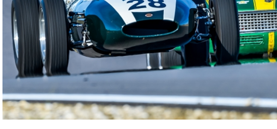
(cropped to fit)