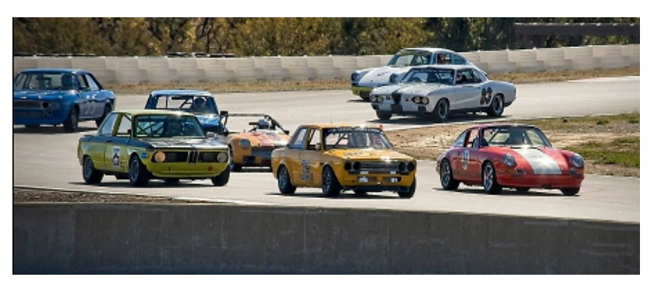
Photographs by Paul Valentine Valentine-Photography.com (cropped to fit)