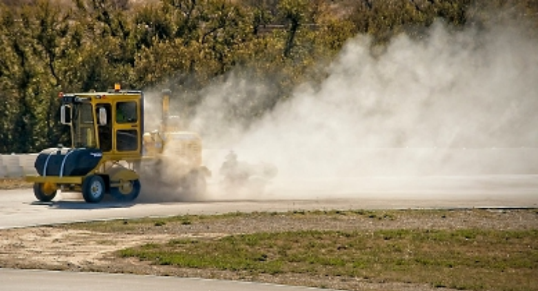
Thank you track workers. Some oil spills are unavoidable...others? Be sure to safety tie drain plugs and oil filter.