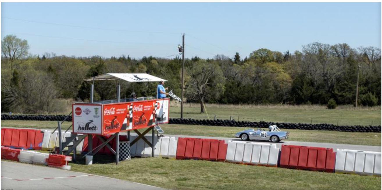
Beautiful racing weekend at Hallett.