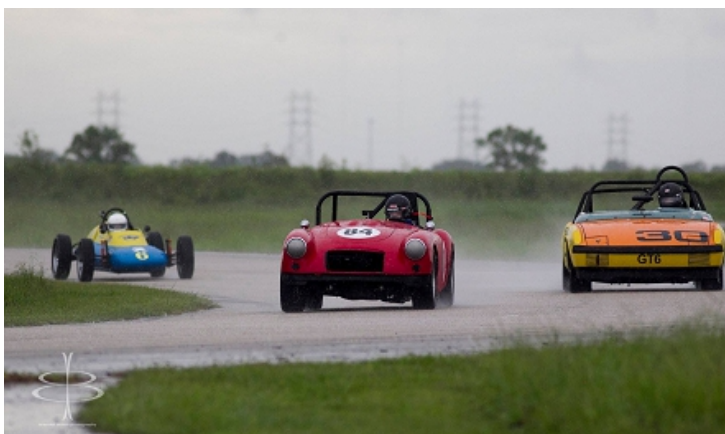
Photograph by Brandall Binion