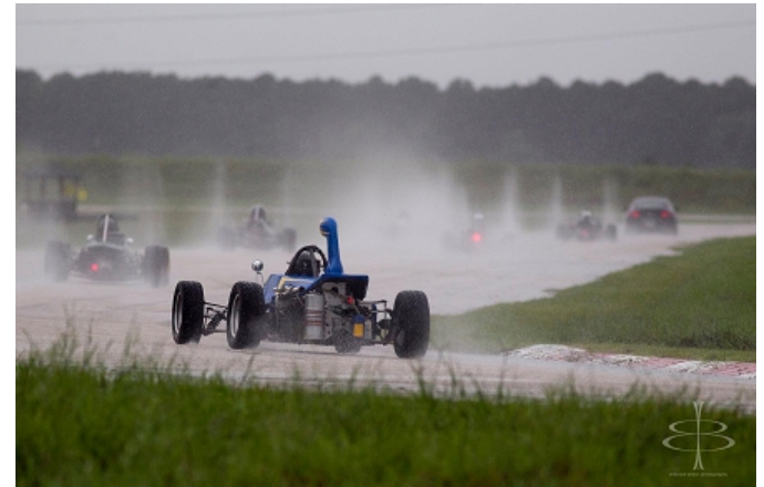
Was the track wet?