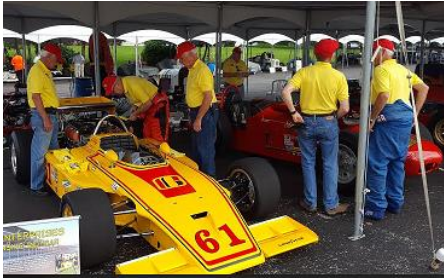
Preparing Bruce's 1972 A.J Foyt Four Cam Ford Coyote.