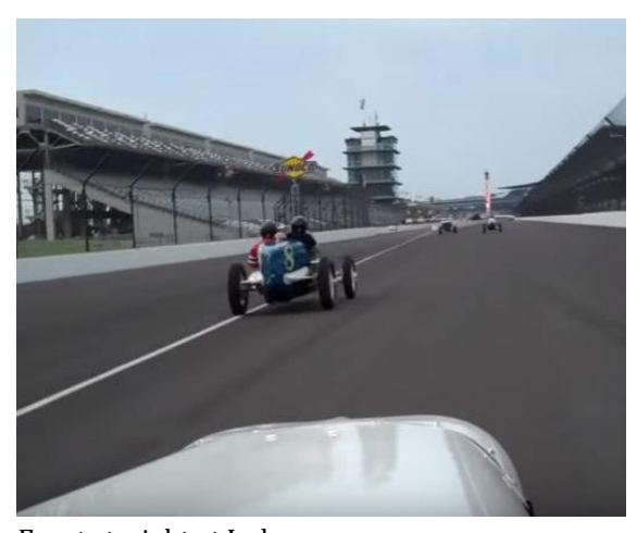
Front straight at Indy.

All the cars began to assemble on track along the wall on the back straight just after turn two. Hundreds of support-crew people were milling around with their cars when the pace car appeared signaling group 1 to begin. Since early cars had riding mechanics, I dutifully performed that task and climbed in, and off we went dodging spectators as we crossed onto the track. Surely all the people would be ushered off the track. Nope! As we came around for the first lap we were cheered on by the hundreds