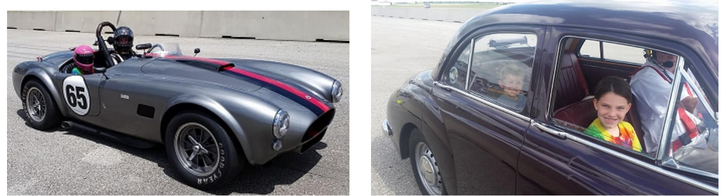
Photograph by Matt Blehm – Family Fun With Rides in Cool Cars at MSR-Houston!