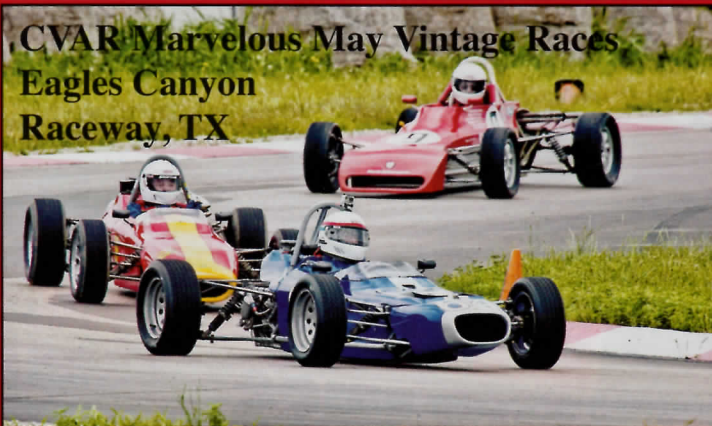
CVAR Marvelous May Vintage Races Eagles Canyon Raceway, TX