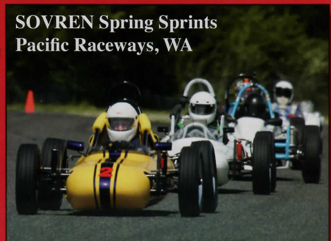
SOVREN Spring Sprints Pacific Raceways, WA