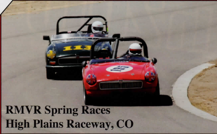
RMVR Spring Races High Plains Raceway, CO

July 2010 - VOLUME 25, NO. 7 $4 USA $5 CANADA