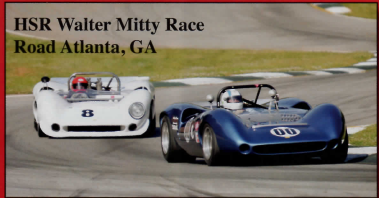
HSR Walter Mitty Race Road Atlanta, GA