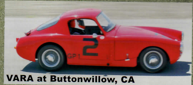
VARA at Buttonwillow, CA

7 25274 75527 1 PRESORTED STD U.S. POSTAGE PAID PERMIT 40 GARDENA, CA