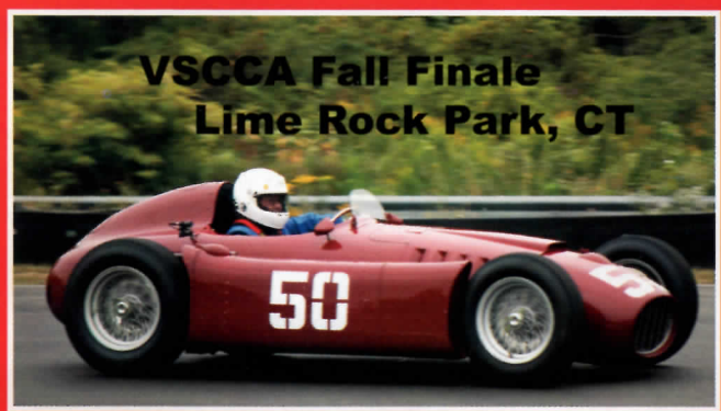
VSCCA Fall Finale Lime Rock Park, CT