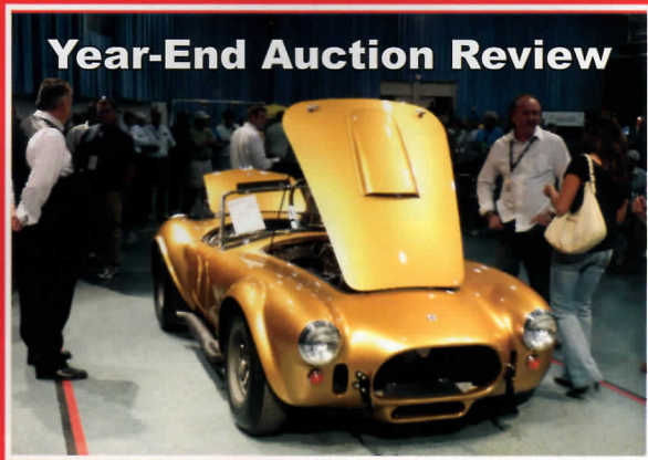
Year-End Auction Review