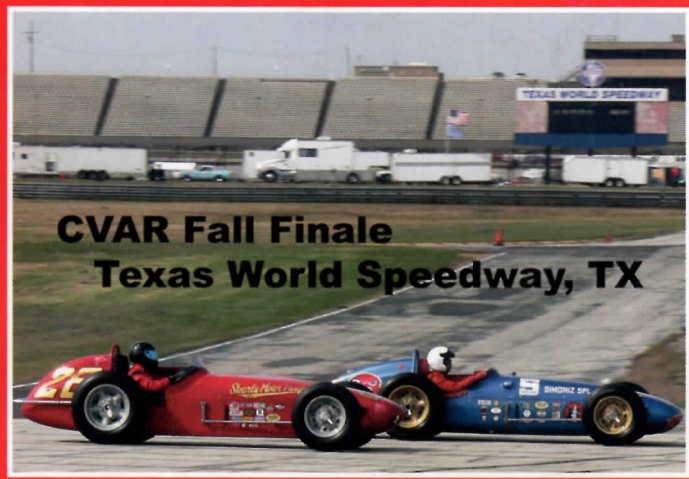
CVAR Fall Finale Texas World Speedway, TX