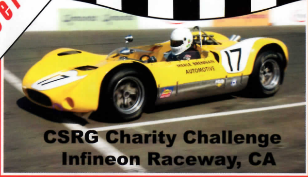
CSRG Charity Challenge Infineon Raceway, CA

January 2010 - VOLUME 25, NO. 1 $4 USA $5 CANADA