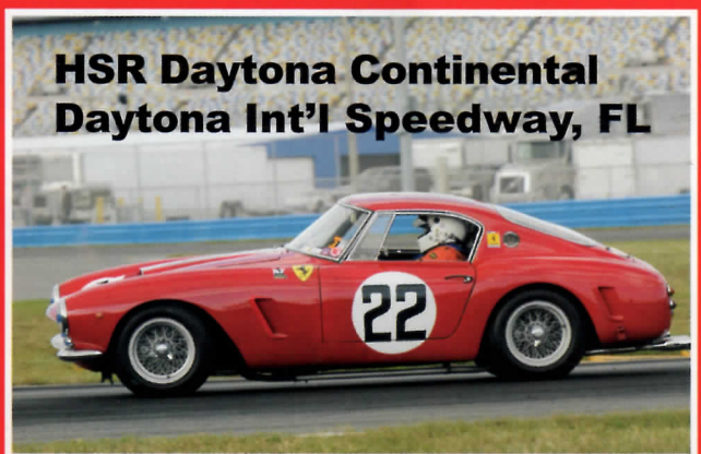
HSR Daytona Continental Daytona Int'l Speedway, FL