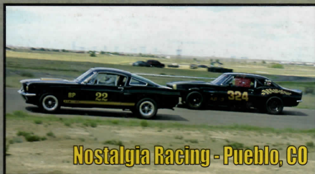
Nostalgia Racing - Pueblo, CO