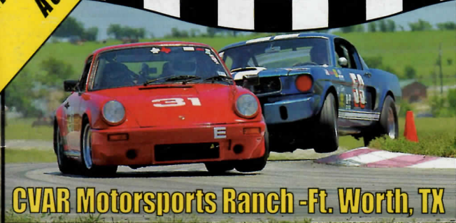
CVAR Motorsports Ranch - Ft. Worth, TX

AUGUST 2006 - VOLUME 21, NO. 8 $4 USA / $5 CANADA