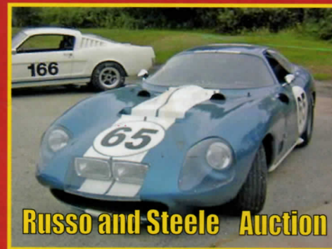
Russo and Steele Auction