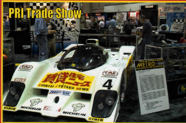
PRI Trade Show